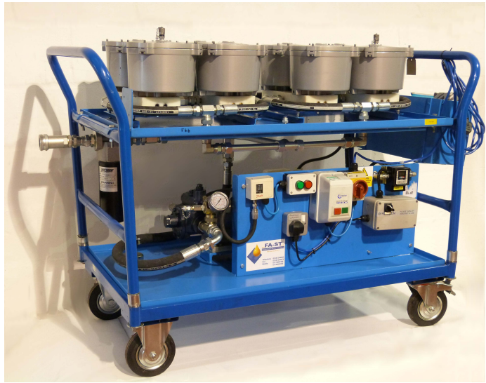
Photographs are for example only, actual product may differ slightly.